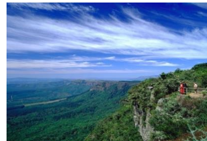
Bourke's Luck Potholes