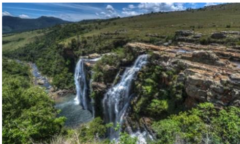
Lisbon Falls God's Window

We can supply you with a comprehensive map for your personal road trip of the Panorama Route. If you would like to take it easy, don't feel comfortable driving and get more background information, then an organised trip will be a good choice.